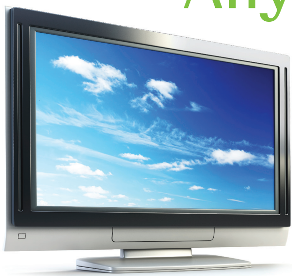
TV with TVLink and iCom