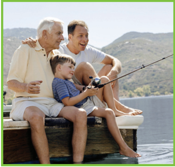
Grandchildren's precious little voices...