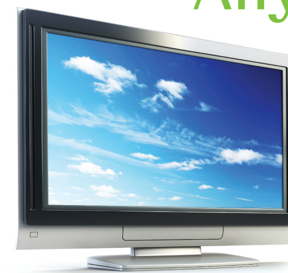
TV with TVLink and iCom