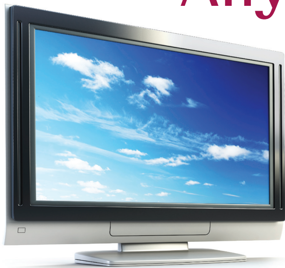
TV with TVLink and iCom