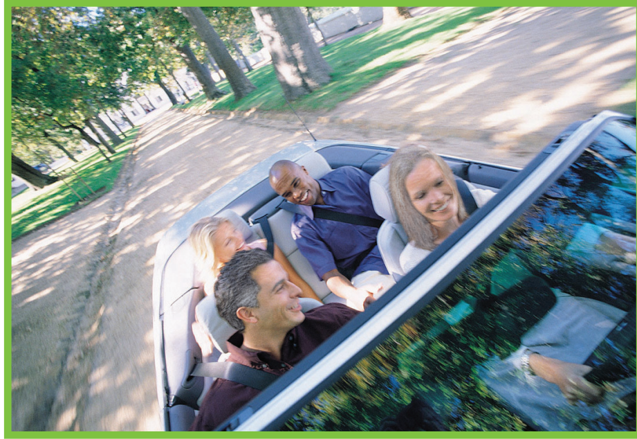
Driving in the car