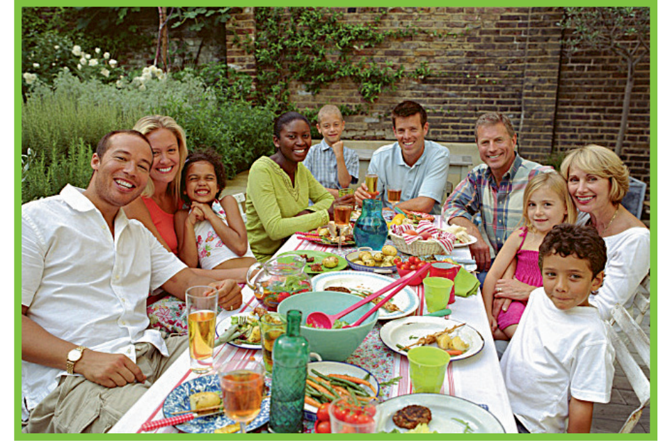
Time with family and friends