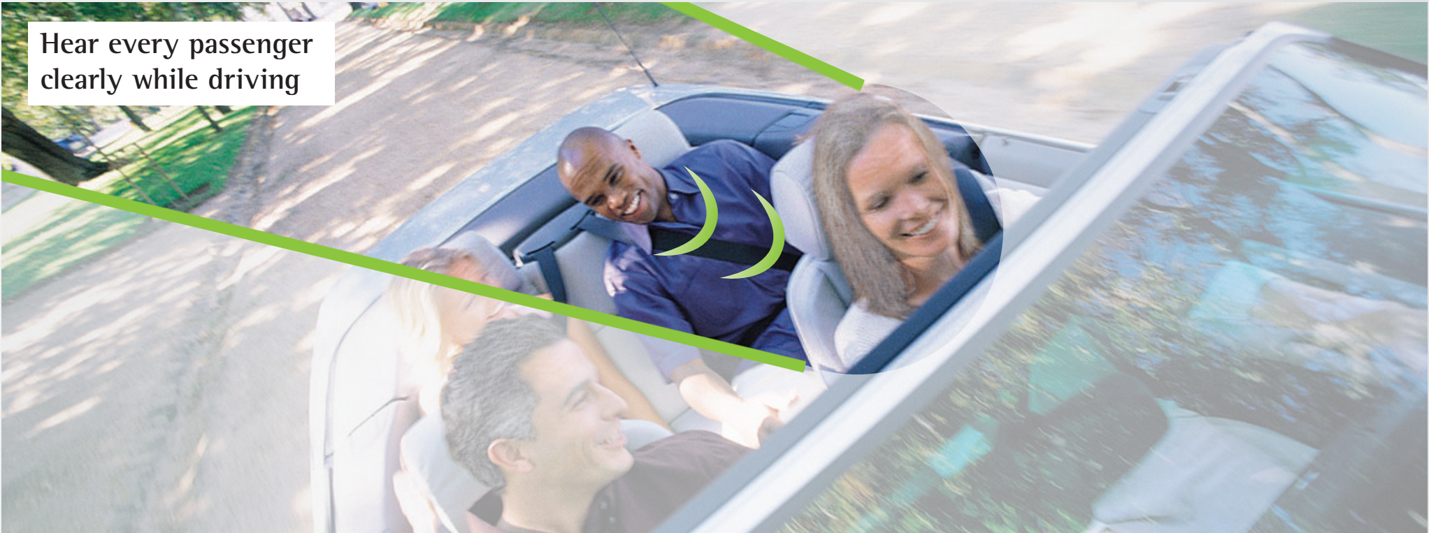
Hear every passenger clearly while driving

Imagine zooming in any voice, wherever it's coming from.