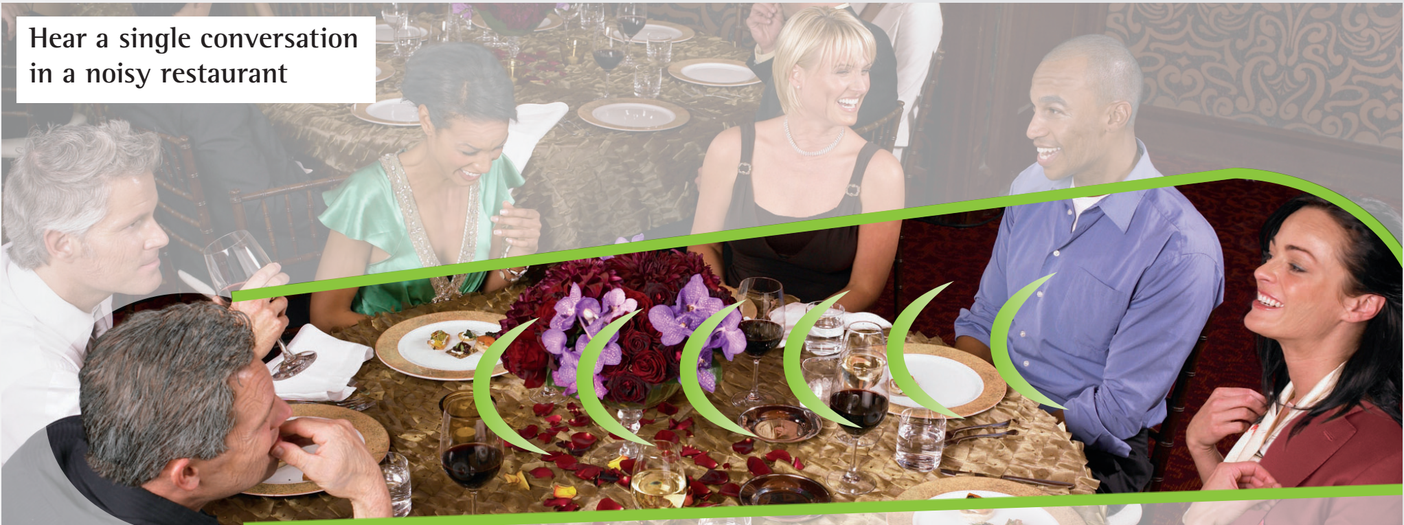
Hear a single conversation in a noisy restaurant

Introducing the Zoom Revolution – amazing hearing technology designed to do what our own ears can't.