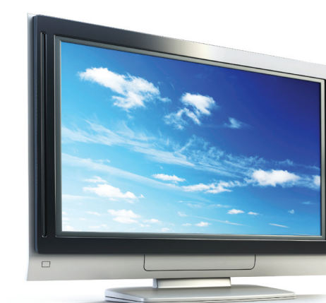
TV with TVLink S and ComPilot