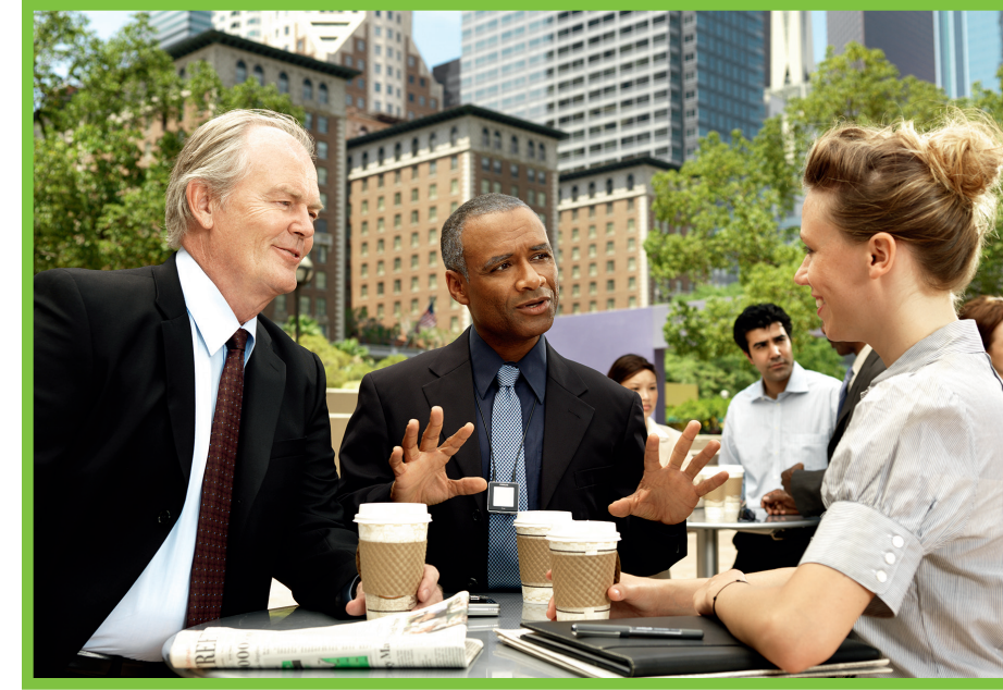
In the business world