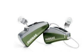
Audéo S SMART

Leading an active life means interfacing with telephones, televisions, MP3 players, computers, stereos and other audio sources. With Phonak hearing devices you can wirelessly connect with telephones, televisions, MP3 players, and many other communication and entertainment systems using Phonak accessories.